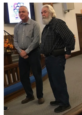
The mystery men