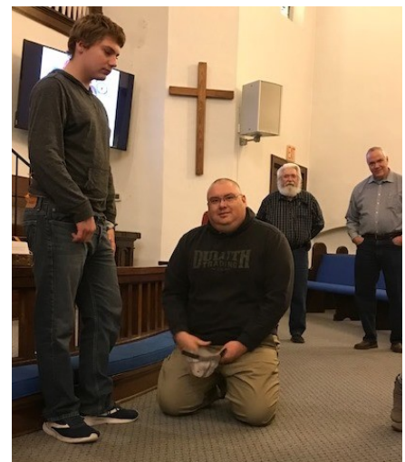
Now, the servant has to face the king who had forgiven him his debt and sentences him to prison also.

For if you forgive others their offenses, your Heavenly Father will also forgive you. Matthew 6:14