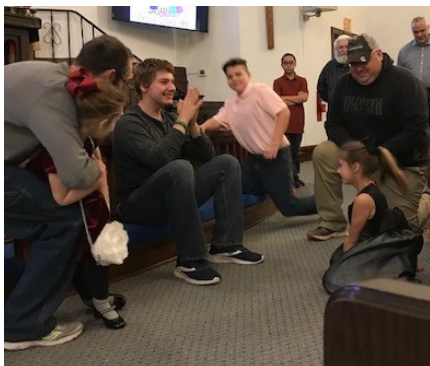
It wasn't all serious!

For if you forgive others their offenses, your Heavenly Father will also forgive you. Matthew 6:14