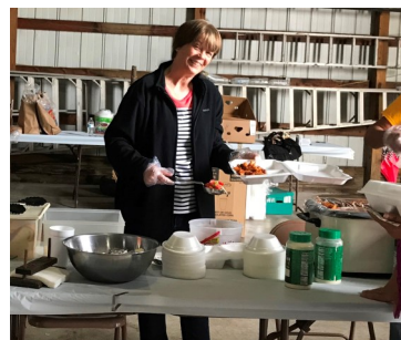
Serving food, Aug. 31