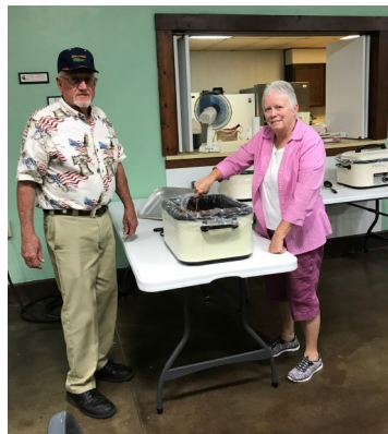
Stirring the sauce, Aug. 31