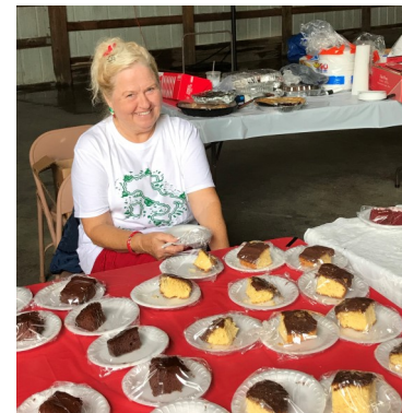
Surrounded by desserts, Aug. 31