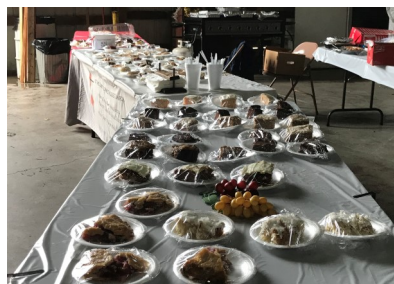
And there they ALL are! Aug. 31 People commented on the variety and quantity of our desserts!