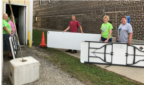
Set Up , Aug 29