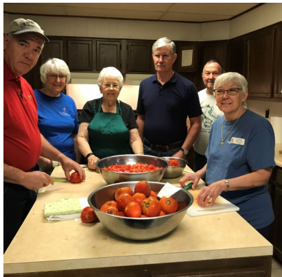
Making salada, Aug. 30