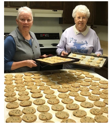
The cookie miracle in action