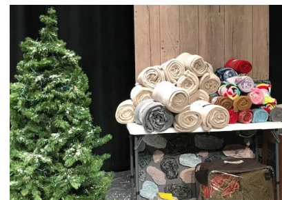
LOTS OF STUFF! Shoes galore (left) and blankets for all (right)