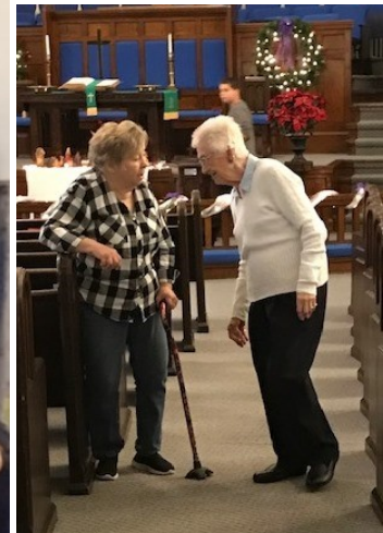
A good day for fellowship!