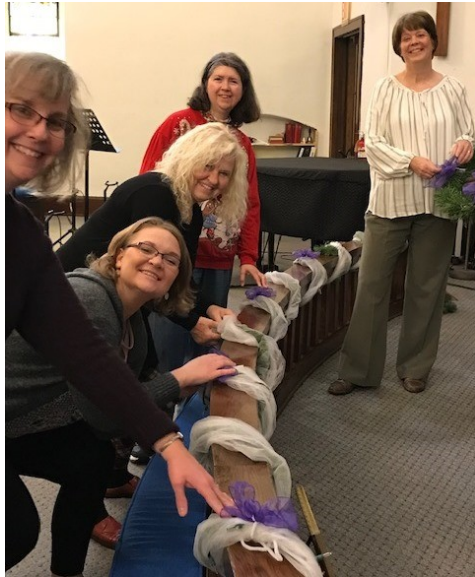
“Gang” of Five.