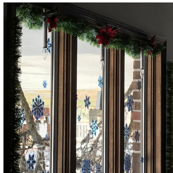
Before and After for the front windows.