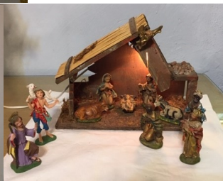
Small Christmas tree with nativity at side. See above for close up of what Christmas is all about.