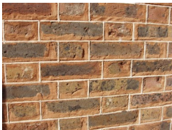
Mortar needs repair

The Church Administrative Board met on January 29. Most of the discussion was centered on water leaks and wearing down of the mortar. Therefore, the board has decided to go forward with plans for tuck pointing and water proofing in the spring.