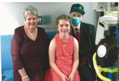
At the prom!