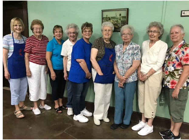
Workers at the June 2 Community Foundation dinner